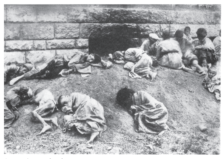
Starvation to death