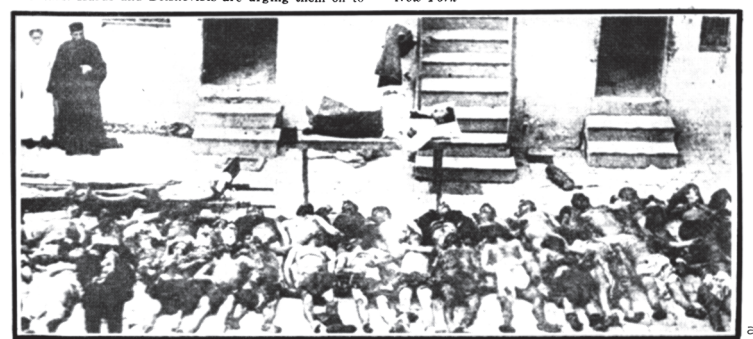
So gruesome a picture as this would be taboo in The Independent if the seriousness of the situation in Armenia now did not demand forceful illustration. These victims of a Turkish massacre typify thousands of Christian Armenians slaughtered by the Turks since the signing of the armistice.