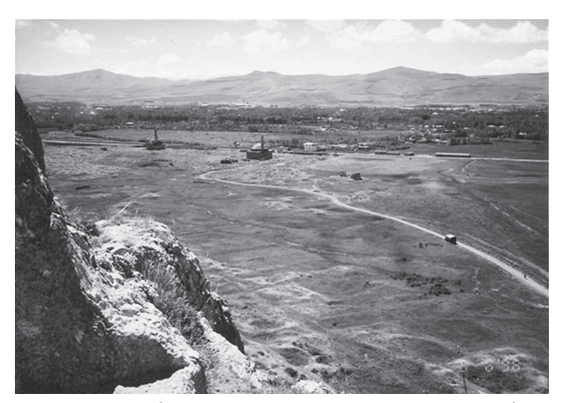
The barren lands of the Aykesdan residential quarter in the city of Van